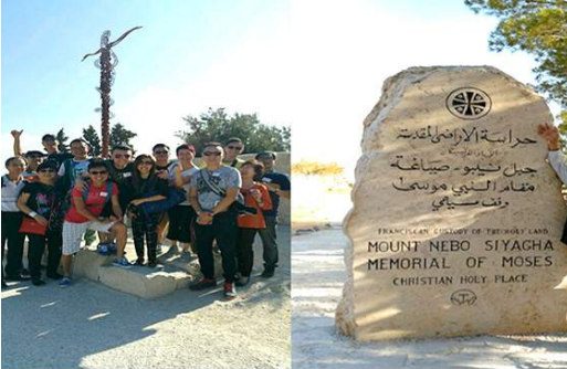
A snake-like sculpture in the form of the cross, representing the pole Moses held up in the wilderness, has been erected here as a memorial.

With our spiritual appetite whetted and stirred, we made our journey into Israel on the 4 th day. We journeyed from Amman in Jordan, via King Hussein Highway (known also as King's Highway) which is linked to Allenby Bridge, on the side of Tel Aviv, the present capital of Israel. Like Singapore and Johore causeway link, there are also two separate distinct immigration/custom checkpoints manned by soldiers and police.