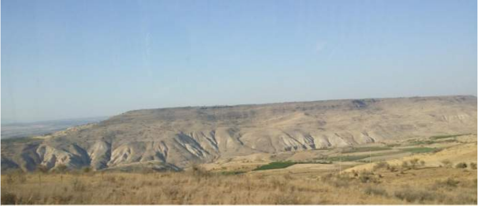
Golan Heights seen from afar

The daily sumptuous meals and additional supply of bottled water were more