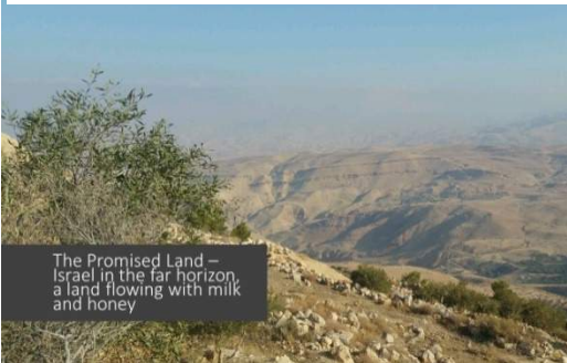
The Promised Land – Israel in the far horizon, a land flowing with milk and honey