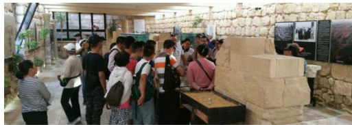
A museum and photo gallery with exhibits of archaeological findings, consisting of civilisation, cultural and religious artifacts belonging to that period.