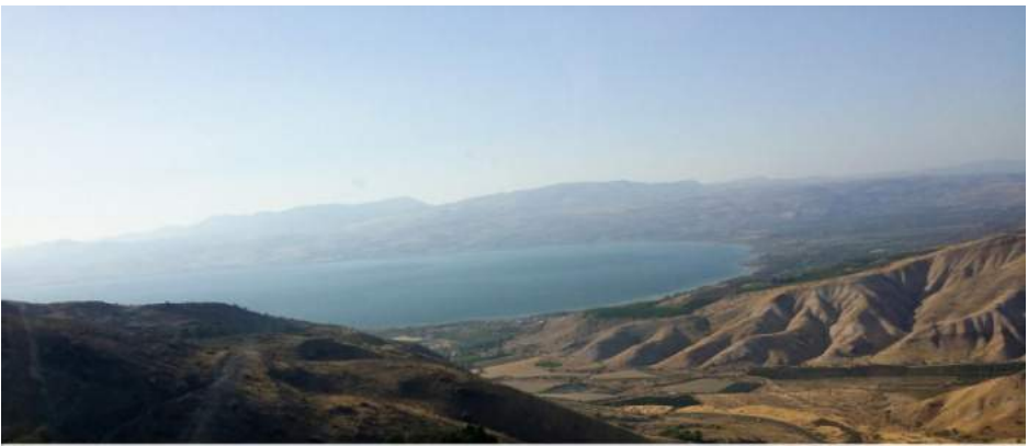
Sea of Galilee seen from afar