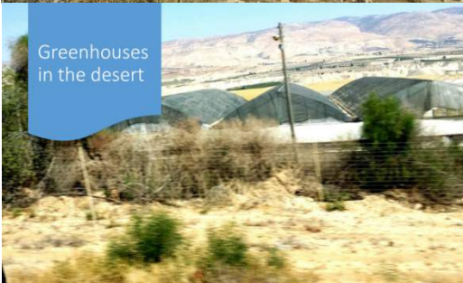
Greenhouses in the desert

From there, we passed the Judean Desert section of the Holy Land which stretches from the Negev along the western side of the Dead Sea up to the north of Jericho. A bone-dry and isolated area noted for its scorching heat, this strip of land is also known as the wilderness of Judah. This is probably the desolate area to which Jesus withdrew when Satan tempted Him at the beginning of His public ministry. (Mk1:12-13) The vast deserts, hills and mountain ranges along the route are all very much alive. Most prominent being the Golan Heights, a prime military hot-bed during the Israel-Jordan 7-day war. Pockets of green oasis and cultivations are very much noticeable from this side of the journey compared to the Jordanian-control side – testimony indeed of our Father's love and faithfulness unto His people.